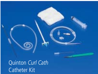
Quinton Curl Cath Catheter Kit