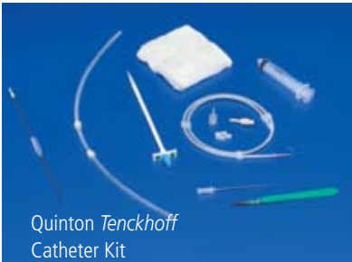
Quinton Tenckhoff Catheter Kit