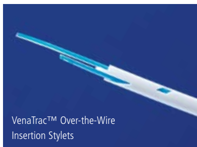
VenaTrac™ Over-the-Wire Insertion Stylets